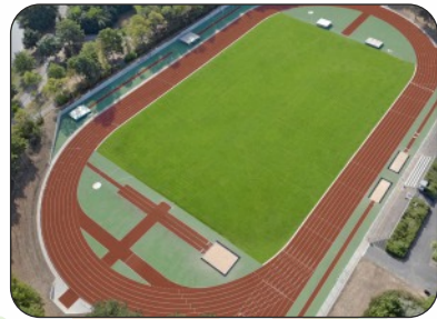
400 Mrt. Standard Track