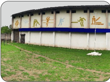
Samrat Asoka Gymnasium Hall

In campus Four Hostel buildings comprises forty-eight (48) rooms with all modern facilities and sanitary blocks. Each hostel is proposed to accommodate about 144 hostlers separate 35 rooms available in Ashwaghosh boys hostel for our students.